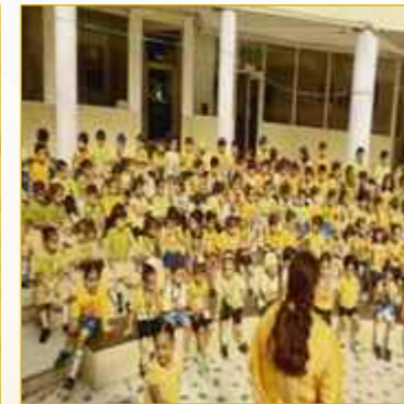
Yellow Day Celebrations