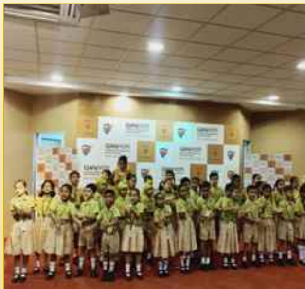
Sacrifice and Courage acclamation on INDEPENDENCE DAY