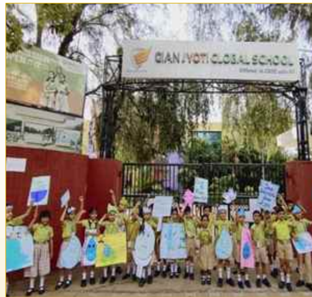
SAVE WATER, an elixir of life