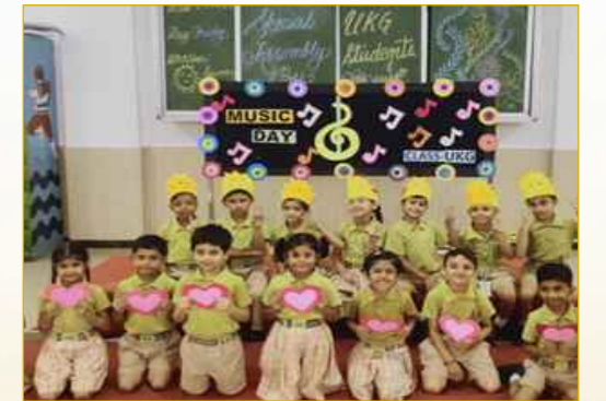
When words fail music expresses- MUSIC DAY CELEBRATIONS