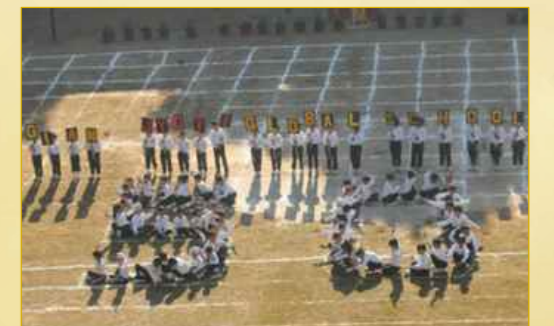
Victory accelerates in the blood of sportsmen- HAPPY 50TH SPORTS DAY