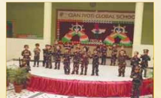
Struggles shape the nation HAPPY INDEPENDENCE DAY