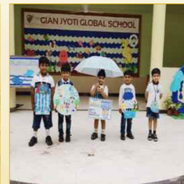
Save blue so that you don’t get blue