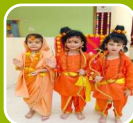
Dussehra Celebration with students dressed as characters from the Epic Ramayana- Preserving the ethos of our culture and learning good moral values