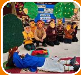
Story Telling Activity taken to another level-Props and Costumes make it look so real.