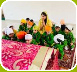
Gurupurab Celebration with complete dedication to the God Almighty and a visit to the Gurudwara- Inculcating religious values among the students.