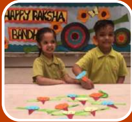
Bond of Love Rakshabandhan celebration in the Kindergarten