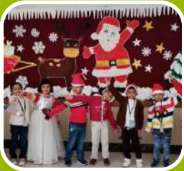
Christmas Celebration - Spirit of winter cheer and holidays ushered by the little angels.