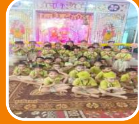
Mandir visit on Janamashtami- connecting students with God Himself and generating respect for religion.