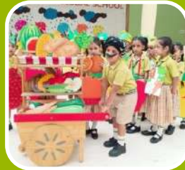
Fruits and Vegetables are our Best Friends- Little wonders get Lessons on Good Health.