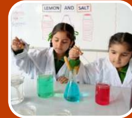
Little Scientists of Kindergarten-Following the Mantra of level-Props and Costumes make it look so real. Learning by Doing